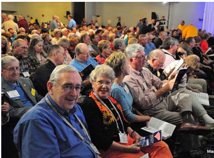
It was a full ballroom and an enthusiastic audience for the quartet and chorus contests.

But one of the key points regarding the facility was the ability to hold all events under one roof. All of this at obscenely low off-season rates in a venue surrounded by great dining and recreational opportunities. Even the weather was perfect! What more could you ask for?