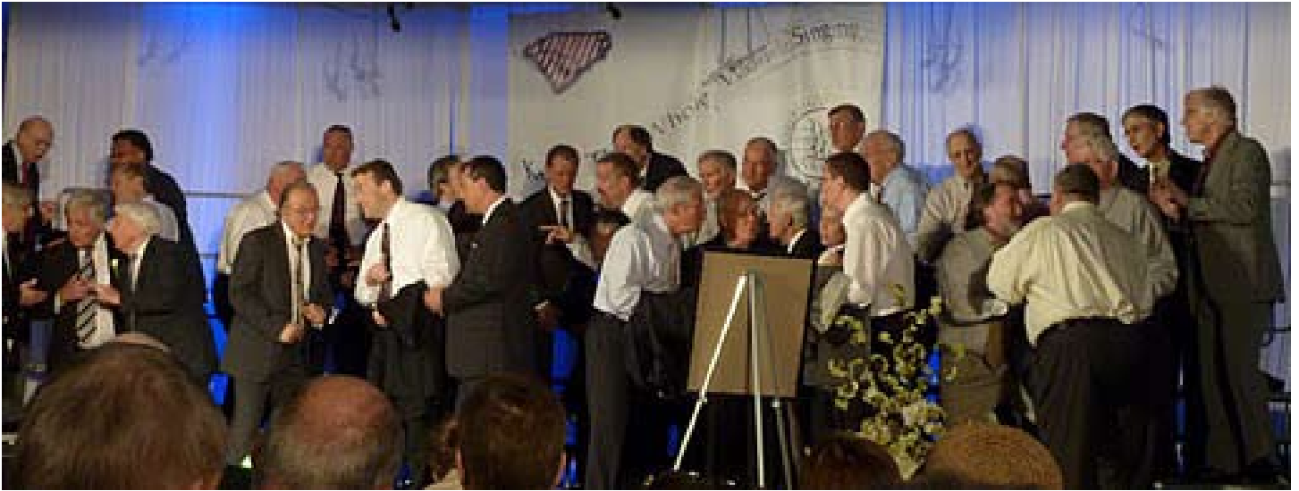
District Champs, Plateau AAA Champs, Int'l Rep – RTP, The General Assembly Chorus