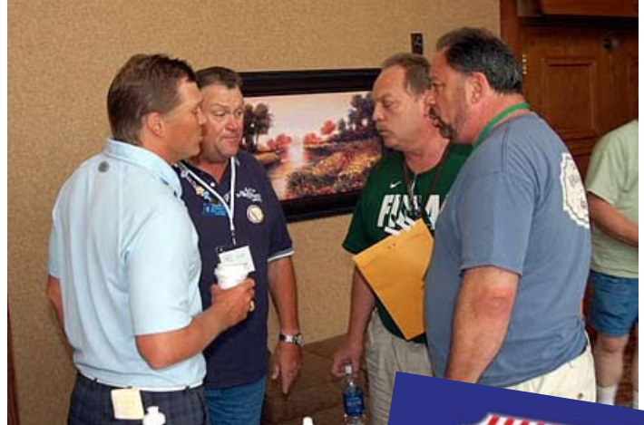
Above: Singing tags was a popular activity throughout the convention.

Mark your calendar!! Charlotte will be the venue on March 25-27, 2011, for a uniquely structured Spring convention. Everything will again be under one roof and look for a combination of craft and chapter management workshops, big chorus singing and quartet competitions. We also are planning to offer events that will be attractive for wives, SO's and children. ❖