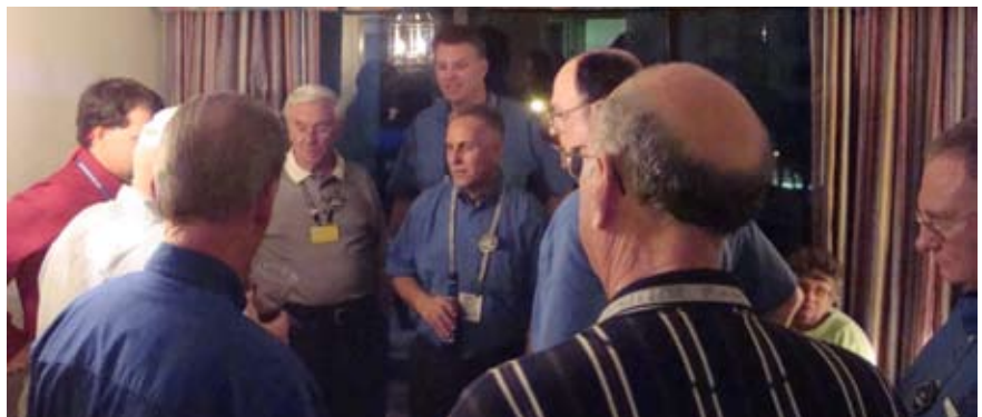
One of the greatest attributes of the Hospitality Suites... meeting friends old and new and singing all the songs and tags you know and love!