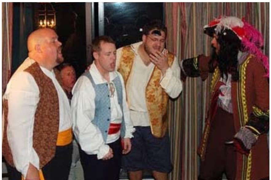
At the Hospitality Suites - 17 Below doing what they do best... entertaining the crowds!