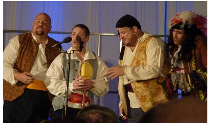
Second Place, 17 Below