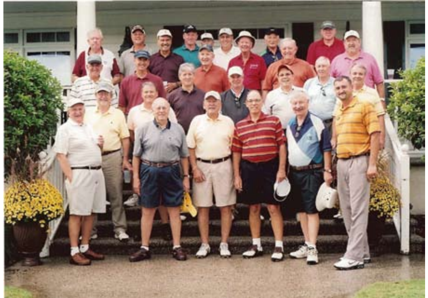
What a great time! The Carolinas District Inaugural Golf Tournament participants.

Kudos to Spartanburg, Grand Strand, Charleston, RTP, Lexington, Wilmington, Pinehurst, New Bern, & Hickory/Charlotte for providing the food & beverages and the warm welcome to all. A big Thank You to all of the quartets who visited every one and gave us memories we will never forget. This is a great tradition that has been revived and is alive & well in the Carolinas! ❖