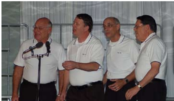
Novice Champs, Easy Livin'