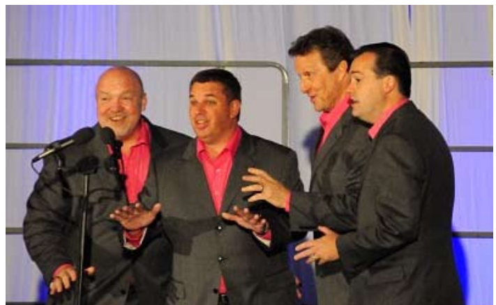
Third Place, One Accord

"I had more fun at this convention than at any previous one- it was like the early 90's, when I first joined. Thank you so much to everyone who made it possible."