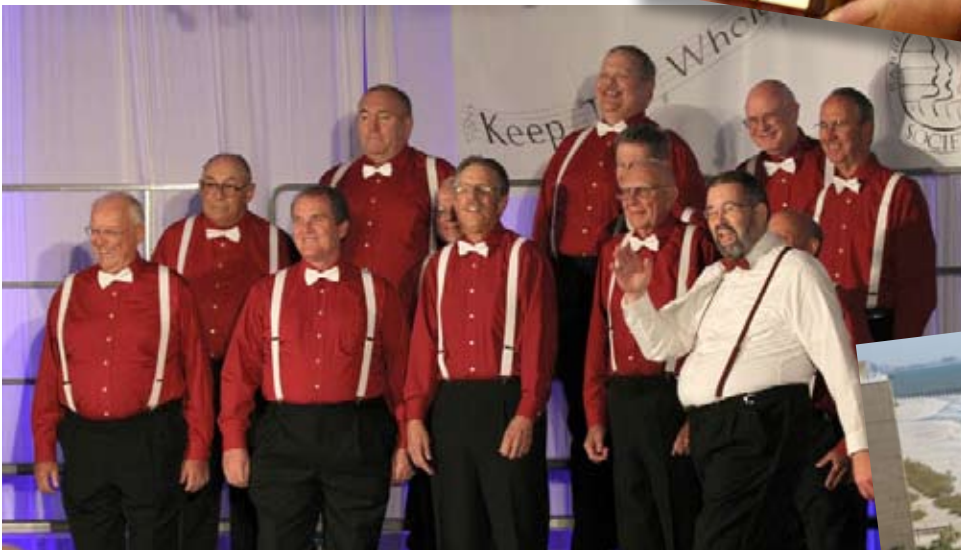
Plateau A champs – Hickory, Carolina Moonlighters