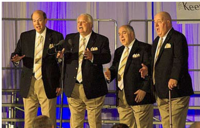
Seniors Champs and Int'l Rep, Village Green