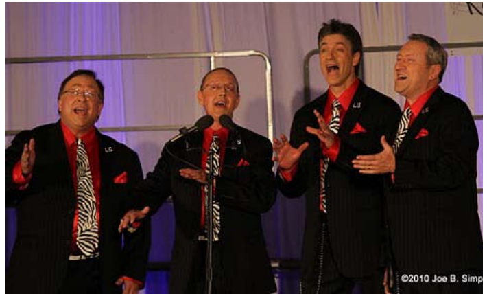
District Champs, Let's Sing

Traditional contest participation has hovered around 30% for many years, but we enjoyed greater than 50% participation from our members! That is truly amazing. Let's keep it up, and be sure to support future District events by getting involved with your chorus and quartets. (cont.)