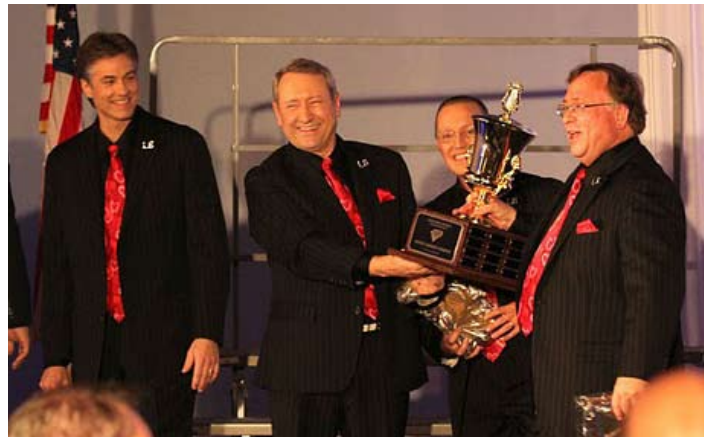
Let's Sing!, newly crowned District Quartet Champions, accepting trophy on the Saturday night Show of Champions

The favorable rates and diverse entertainment possibilities (including a golf tournament) attracted roughly a quarter of the attendees on Thursday- unprecedented for a District convention. All that much more time for tag singing, woodshedding and just getting to know your buddies better.