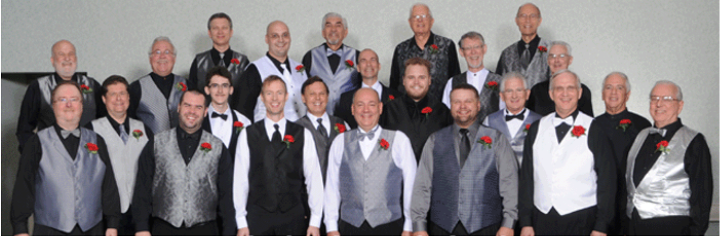
Second Place, Plateau AA Champs – Central Carolina, Heart of Carolina Chorus