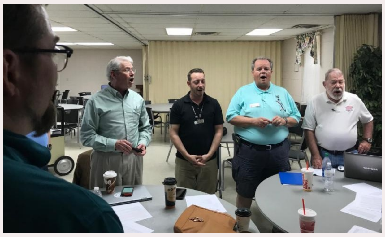
NSC Board Meeting: Singing goes a long way in reminding us we're on the same team.

• Barbershop Revival - The Board consensus is that this is the right thing to do and endorsed pursuing the project, but with additional support and controls to spread the risk and cover the costs.