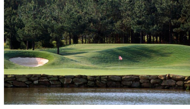
Heritage Golf Course

Start time is 1PM. Tickets are $100 and include greens fees, a bucket of balls, a golf cart for two, and a delicious awards dinner at the end of the day's play.