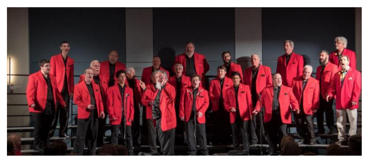
Heart of Carolina A Cappella