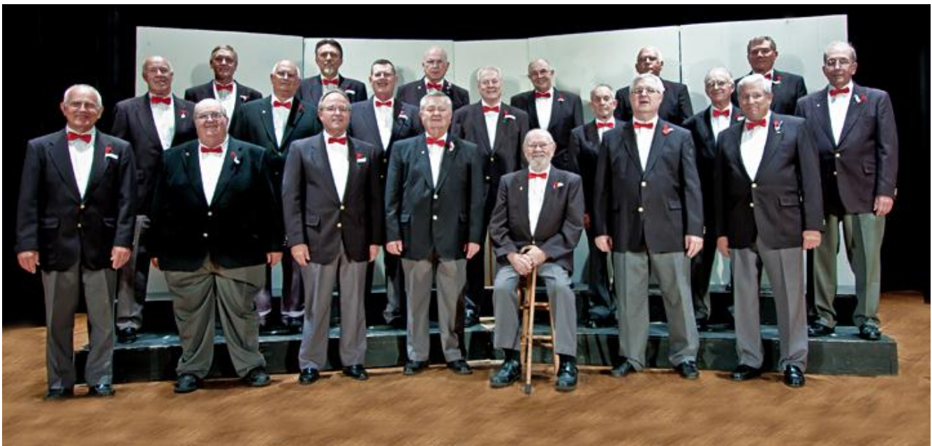
Albemarle Sounds Chorus (circa 2006)