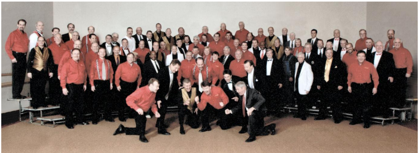
The Rocky Mount Chorus – 2006 Dixie District Champion

The Rocky Mount Chorus (Down East Harmonizers) rechartered in 1988-1989 and competed at Dixie District Conventions until about 1995 or so when older members starting dying and several younger members moved and we became a smaller chorus and struggled to have all parts at rehearsals. The Rocky Mount Chorus continued for a few years singing around town as a Very Large Quartet (VLQ) and had fun several years doing this but our attendance at District Conventions was not to be any more. Several of the original chorus sang with the Rocky Mount Big Chorus that won the 2006 Dixie District Chorus contest and that was a special treat for everyone involved.