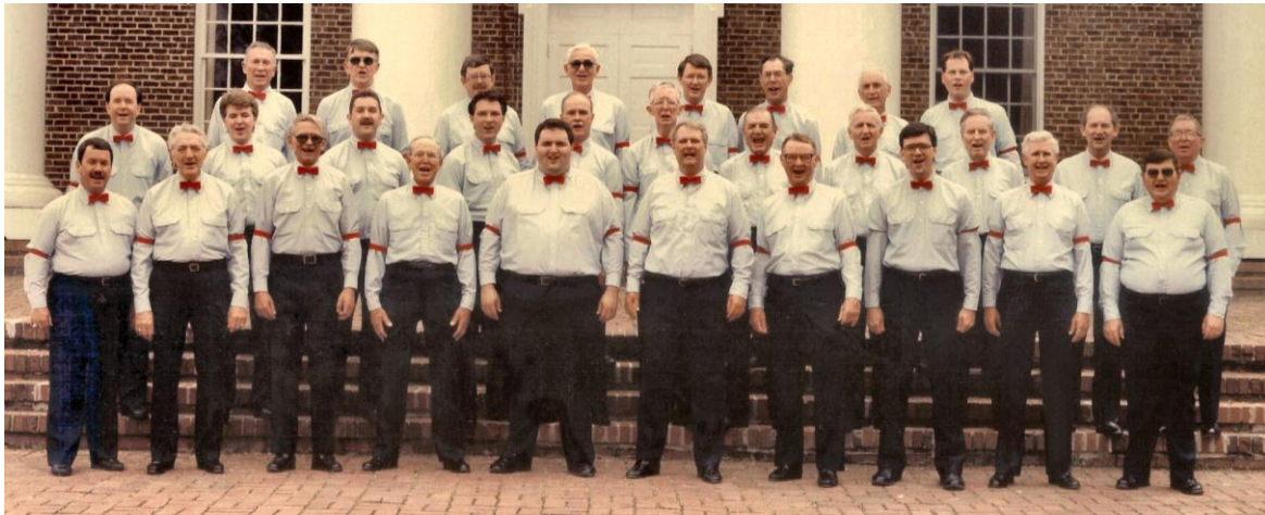
The Rocky Mount Chorus in 1989

Rehearsals: Monday, 7:00 PM at Englewood United Methodist Church, 300 South Circle Dr., Rocky Mount, NC 27804