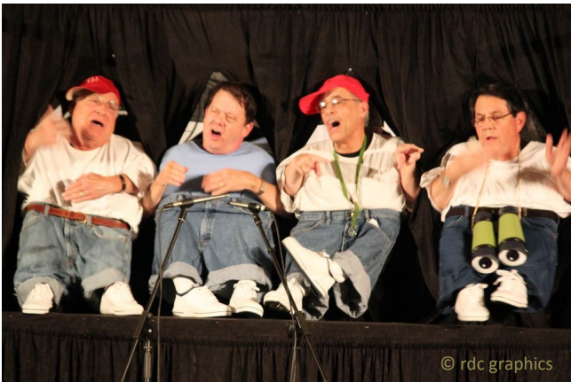
Easy Livin – District Novice Champion