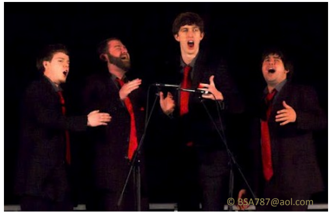
Vigilantes – Dixie District College Quartet Champion