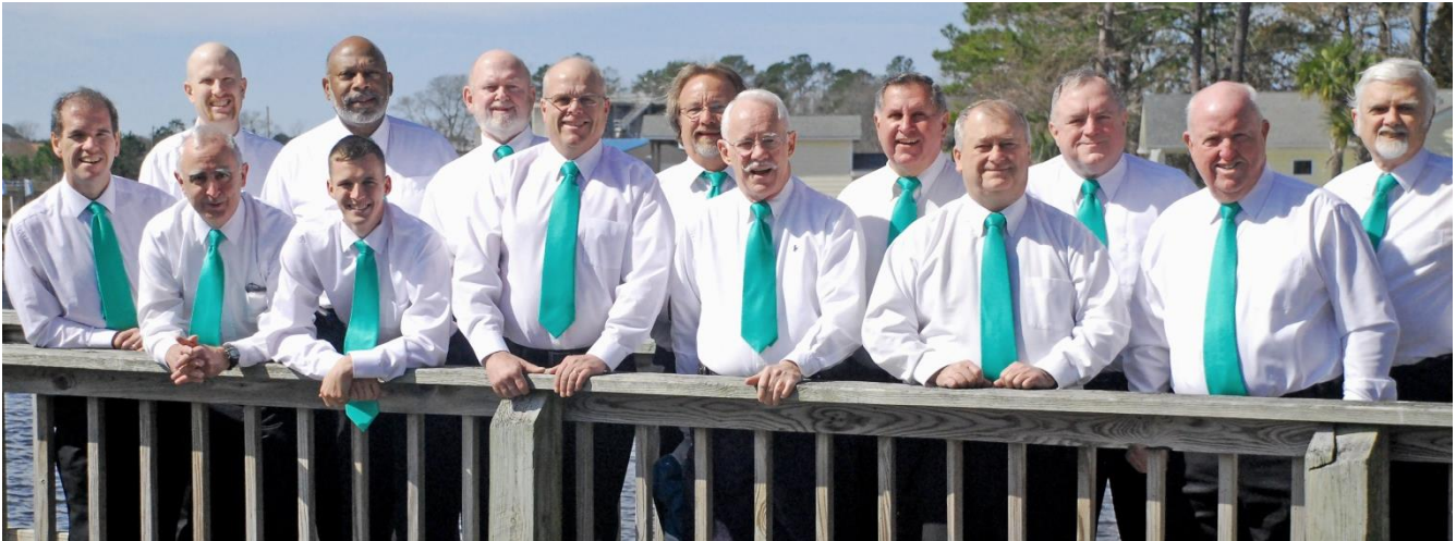
New River Harmony 2012