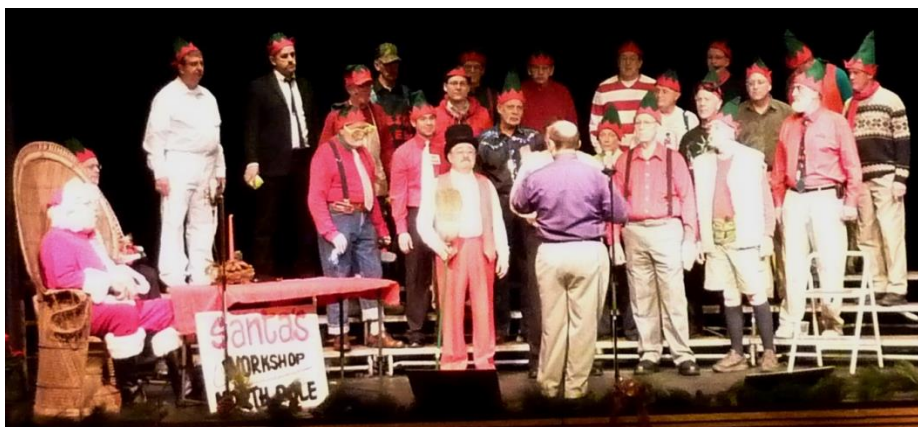
Santa Claus and his elves made an appearance at the Appalachian Christmas Harmonies Show.