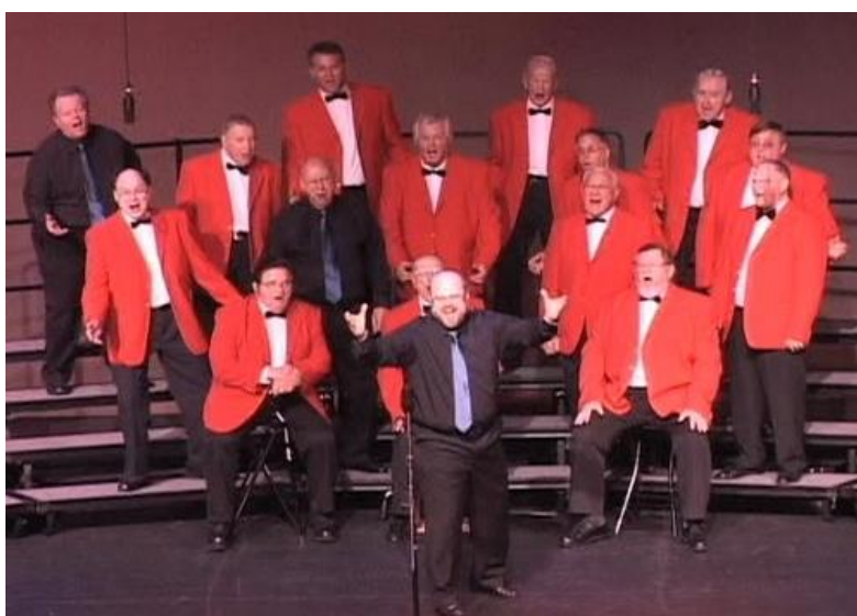
The Charleston Barbershop Chorus performing at the Palmetto Vocal Project first annual show in April 2012

www.facebook.com/charlestonbarbershopchorus