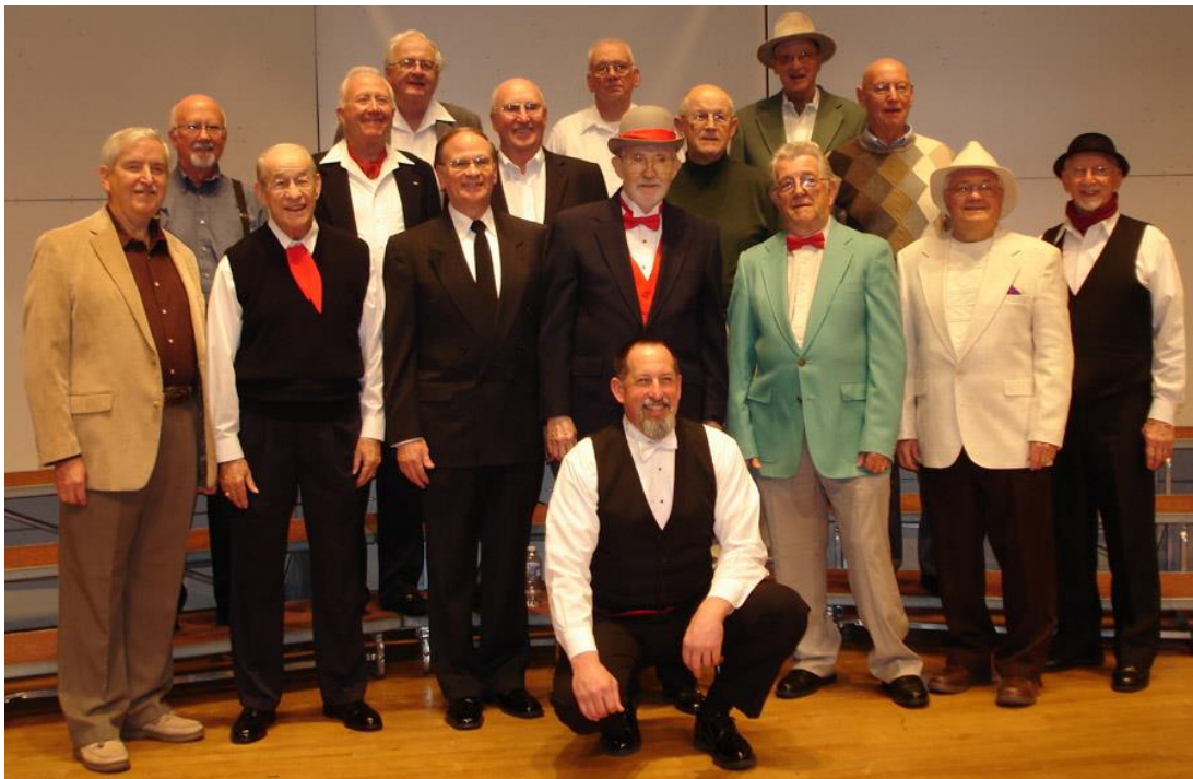
One of our Past Show Photos