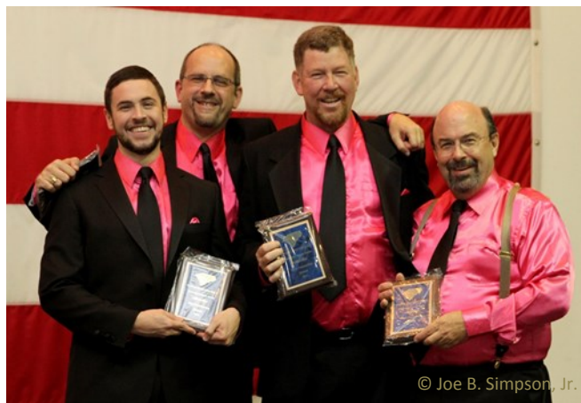
Supersonic Most Entertaining Quartet