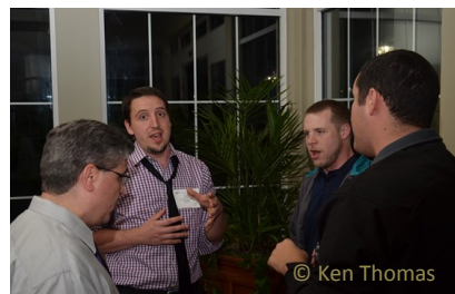
Tagging In the lobby

Of course, Saturday was day full of singing tags, coaching sessions, and touring the many site of Charleston.