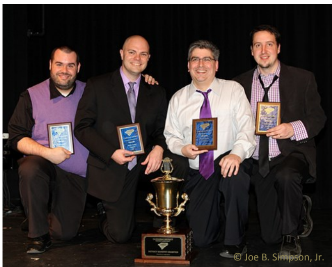
WHAMMY! 2014 District Quartet Champion

The Fall Festival had a dynamic start with a very close contest for the District Quartet Championship—only two points between first and second place and only 17 points separated first from fourth place. When the dust settled WHAMMY! was crowned the 2014 Carolinas District Quartet Champion. Placing a close second was Tucker Street followed by Harmony Grits and Supersonic . Each quartet sang a third song, not necessarily contestable, as a new feature to make the contest more interesting. The audience then voted to select Most Entertaining Quartet. Supersonic took the honors with their dramatic rendition of Loch Lomond .