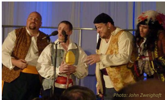
Second Place 17 Below