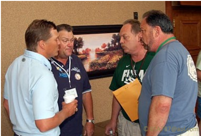
Singing tags was a popular activity throughout the convention.