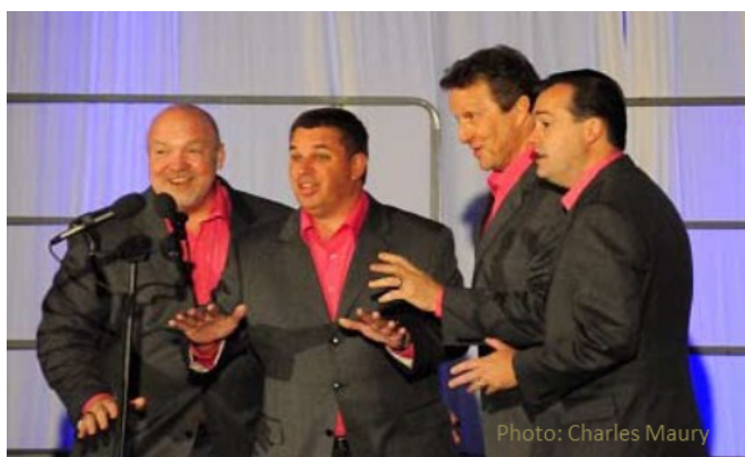
Third Place One Accord