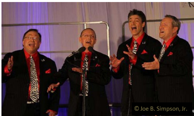
District Quartet Champion Let's Sing!