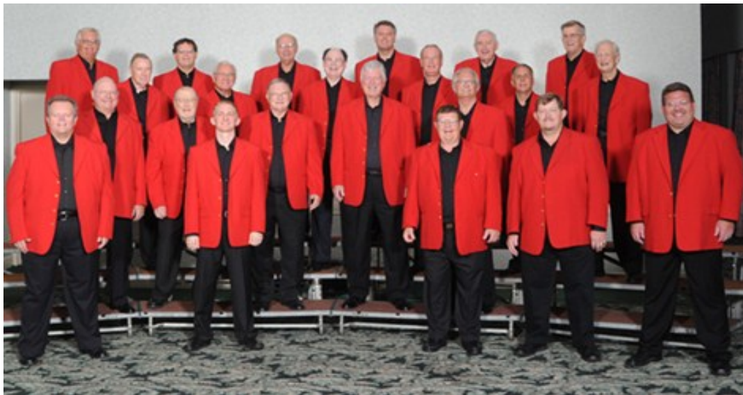
Charleston Barbershop Chorus