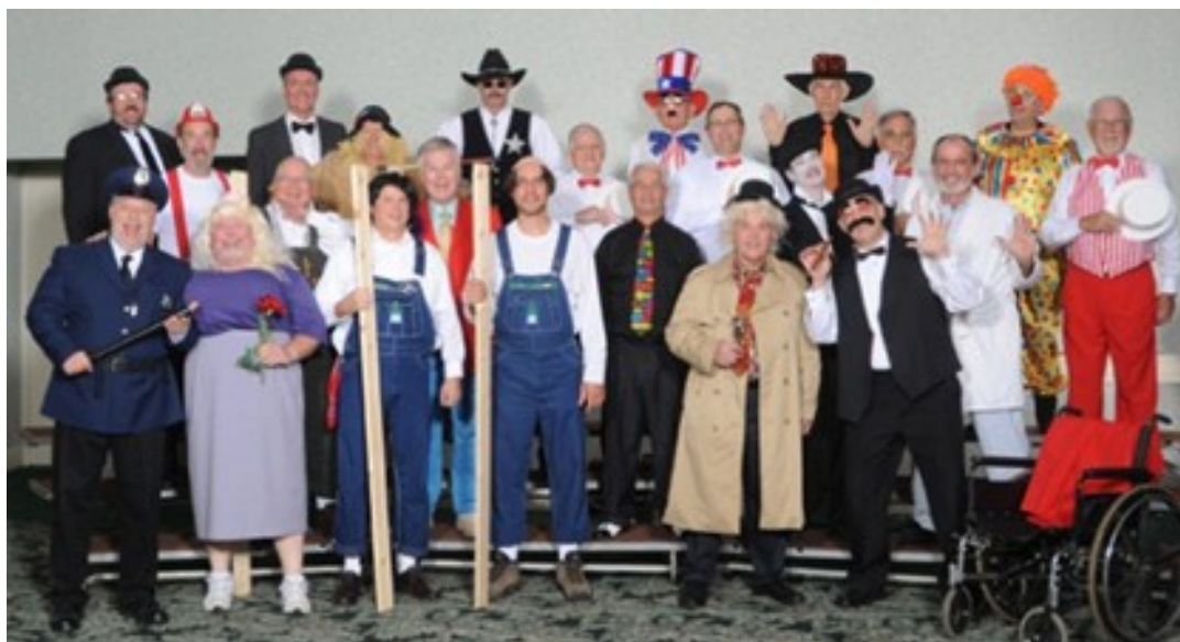
Main Street Harmonizers