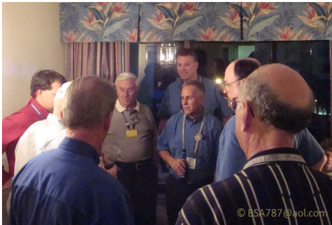
The hospitality suites on Saturday provided a fitting ending to a fun convention. Spartanburg, Grand Strand, Charleston, RTP, Lexington, Wilmington, Pinehurst, New Bern, & Hickory/Charlotte all hosted hospitality suites providing the food & beverages and the warm welcome to all.