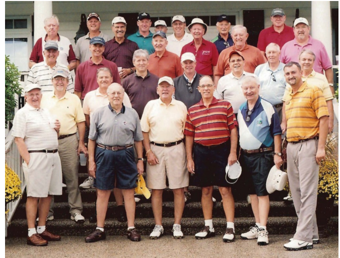
What a great time! The Carolinas District Inaugural Golf Tournament participants.