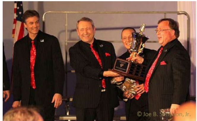
Let's Sing! , newly crowned District Quartet Champions, accepting trophy on the Saturday night show.

The favorable rates and diverse entertainment possibilities (including a golf tournament) attracted roughly a quarter of the attendees on Thursday-unprecedented for a District convention. All that much more time for tag singing, woodshedding and just getting to know your buddies better.