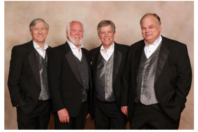
Hazardous Moving Parts 2014 District Novice Champion