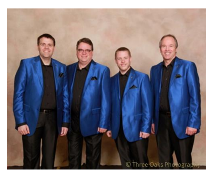
Zero Hour Int'l Quartet Reps for 2014 Contest

Int'l Chorus Rep – Carolina Vocal Express Chorus Champion – Triad Harmony Chorus