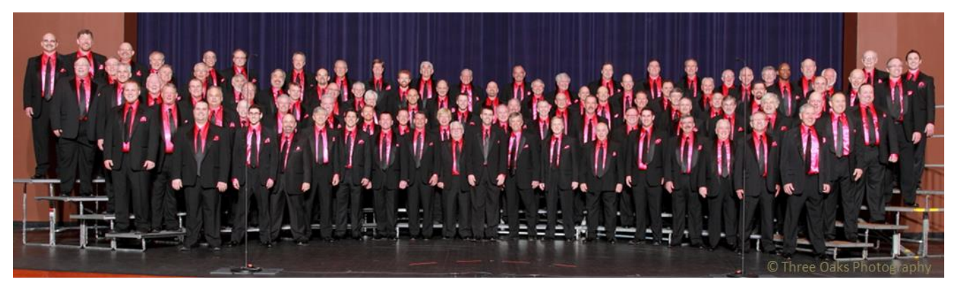
Carolina Vocal Express – Greater Gaston, NC International Chorus Representative for 2015 Contest