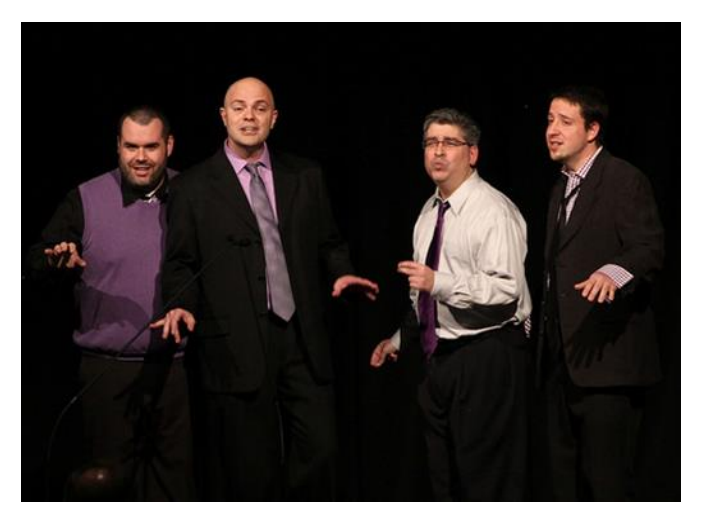
WHAMMY! 2014 District Quartet Champion