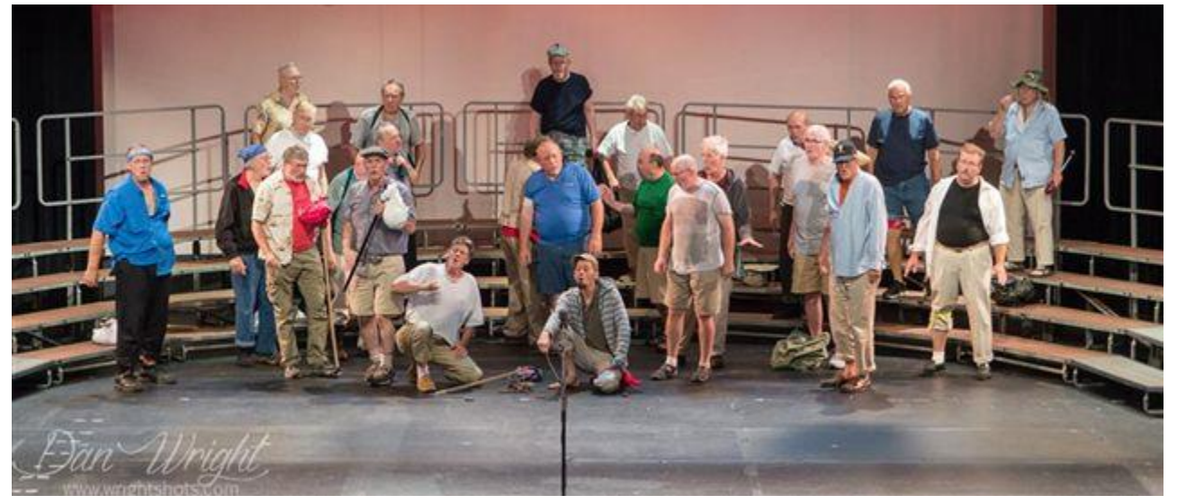
The Land of the Sky Chorus performing on a show at Harmony University.