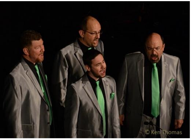
Supersonic Most Entertaining Quartet