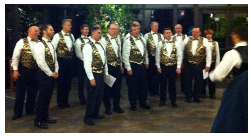
The Cross Creek Chordsmen performing at the Cape Fear Botanical Gardens.

The chapter has already made an impact on the Fayetteville Community. The chorus made its public debut in July when it performed the National Anthem at the Fayetteville Swamp Dogs (Minor League Baseball team) and also sang Take Me Out to the Ballgame at the 7<sup>th</sup> inning stretch. The chorus was interviewed by the Fayetteville Observer local newspaper and the chorus made the front page of the November 17<sup>th</sup>, 2014 issue of the paper. The article included photos and a two minute video was featured in the online version of the newspaper. In December the chorus performed several times at the Cape Fear Botanical Gardens "Lights in the Garden" Tour.