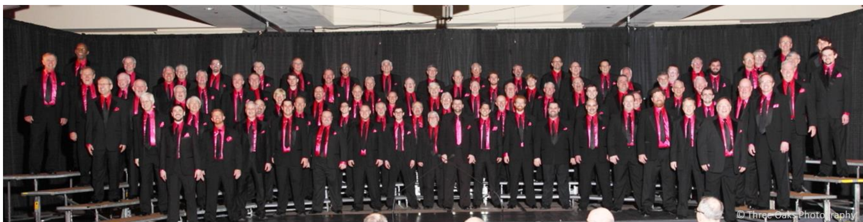
Carolina Vocal Express – Greater Gaston, NC International Chorus Representative for 2016 Contest