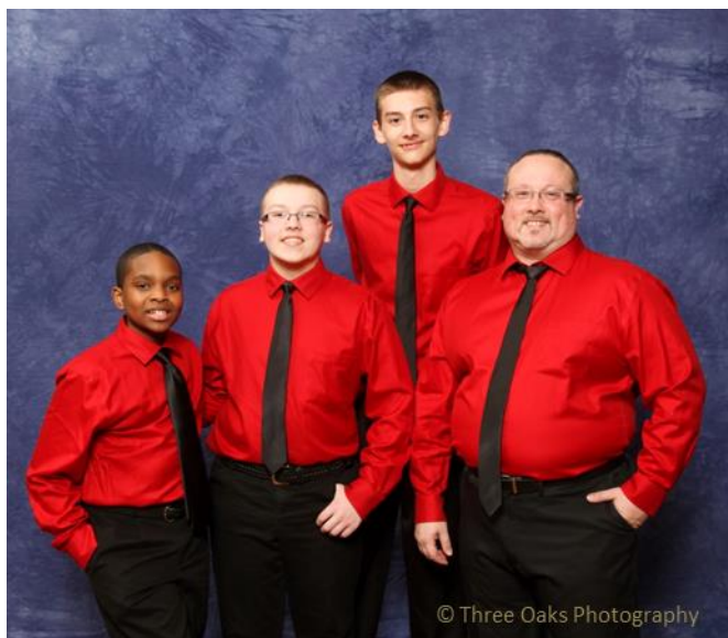
The Young Guns 2015 District Novice Champion