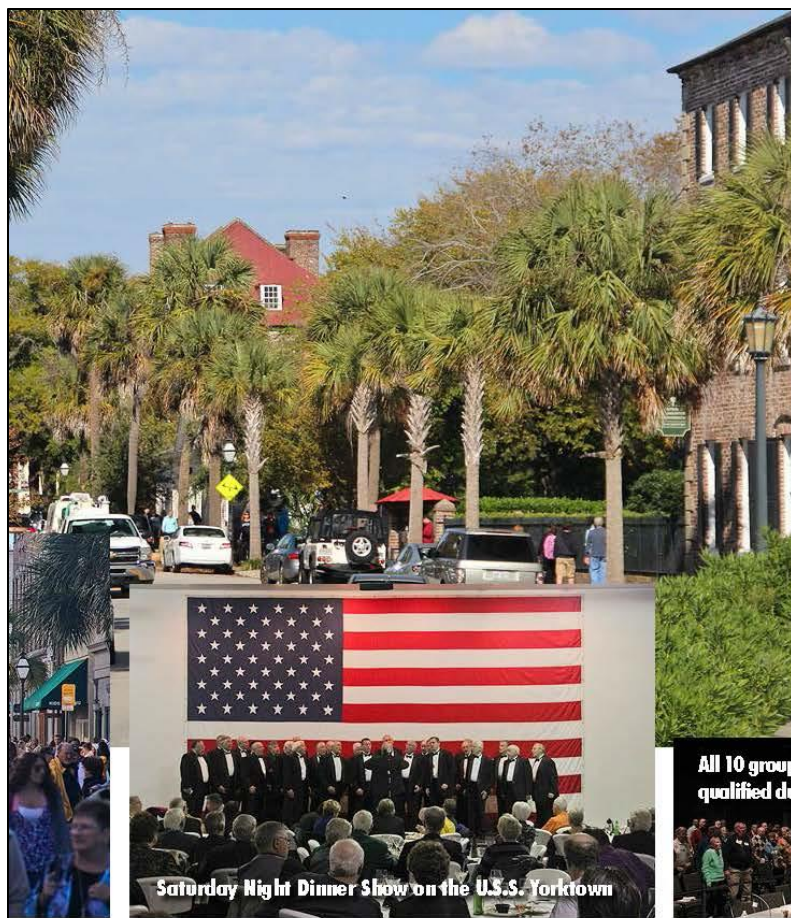
Saturday Night Dinner Show on the U.S.S. Yorktown