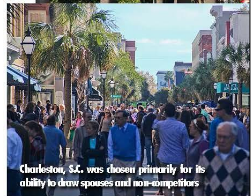
Charleston, S.C. was chosen primarily for its ability to draw spouses and non-competitors