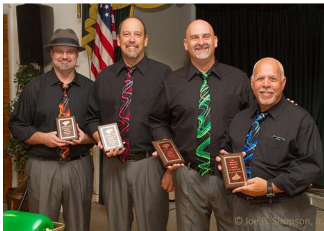
Infinity Audience Favorite