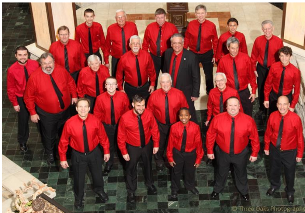
The Heart of Carolina Chorus – Central Carolina 2015 District Chorus Champion