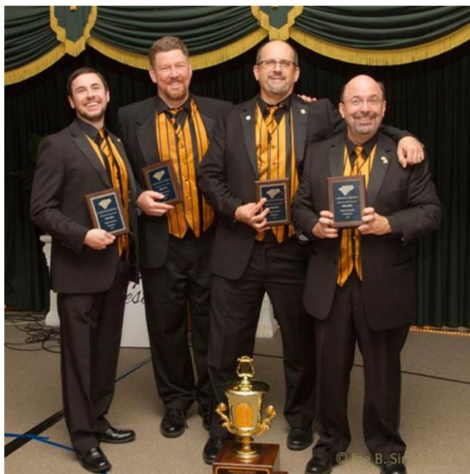
Supersonic 2015 District Quartet Champion