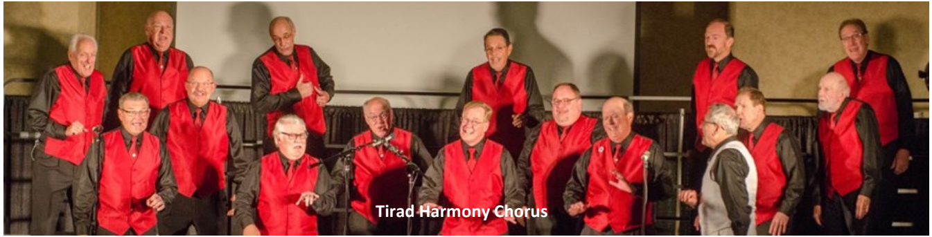
Tirad Harmony Chorus