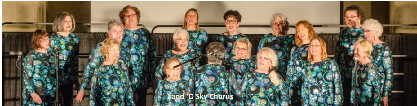
Land 'O Sky Chorus