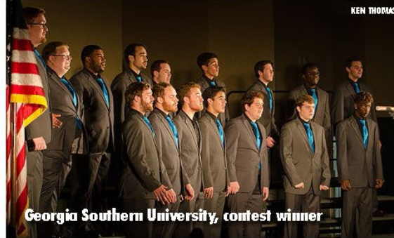
Georgia Southern University, contest winner