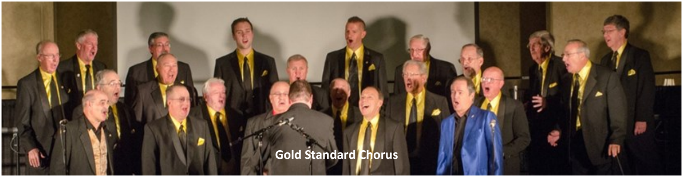
Gold Standard Chorus