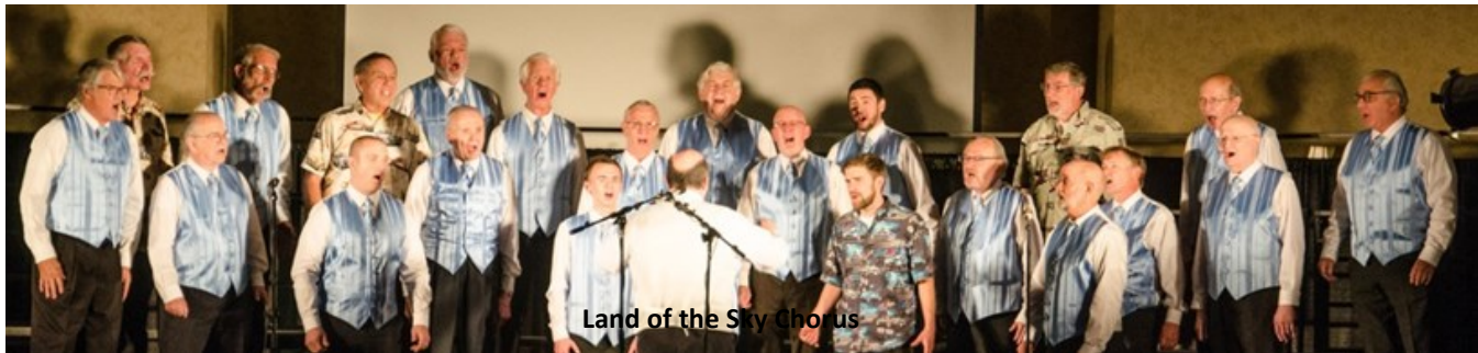
Land of the Sky Chorus