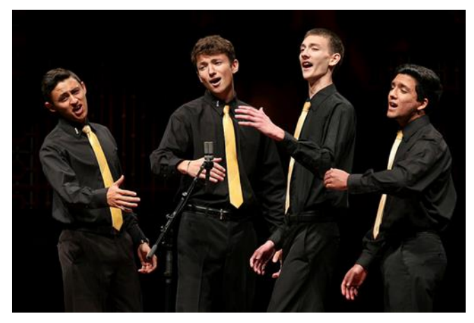
No Strings Attached