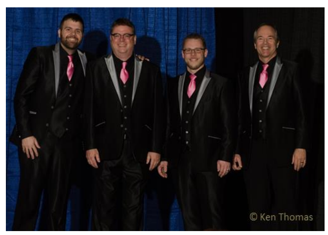
Zero Hour Int'l Quartet Reps for 2016 Contest

Novice Quartet Champion – No String Attached Int'l Chorus Rep – Carolina Vocal Express Chorus Champion – Gold Standard Chorus