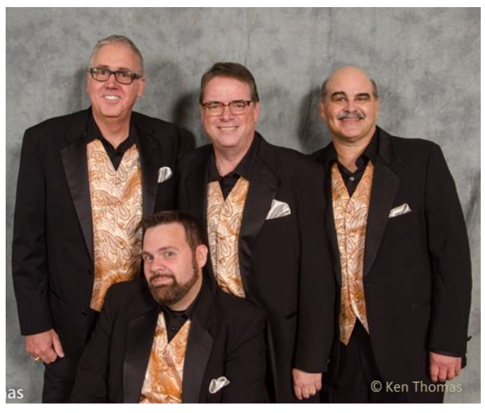
The Oneders 2016 District Quartet Champion Audience Favorite