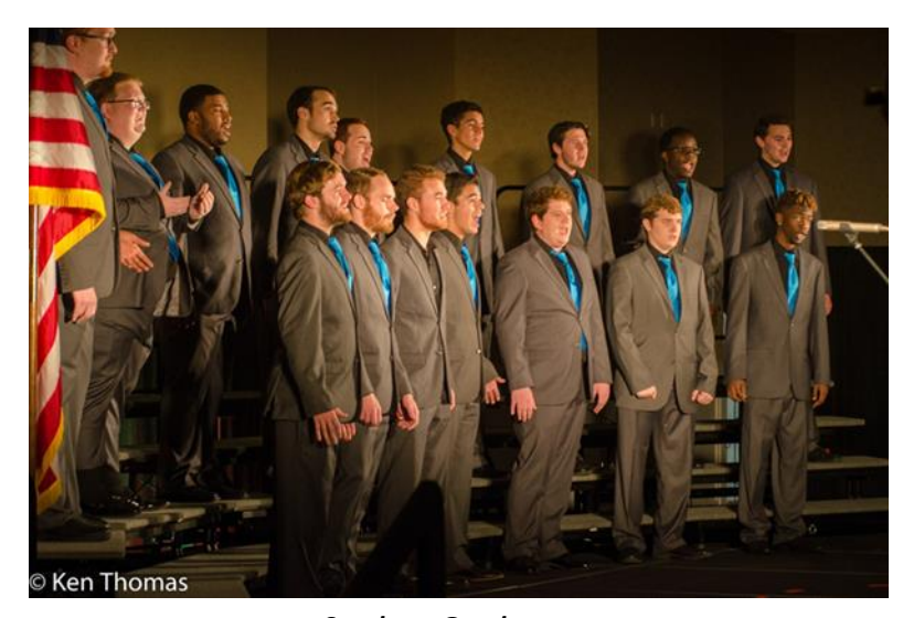
Southern Gentlemen Southern Georgia University

The second new activity was part of a new International Seniors Chorus Festival sponsored by the Barbershop Harmony Society. The Carolina Statesmen , a seniors chorus with members from chapters across the District, sang for score and qualified for the Senior Chorus Festival to be held at the 2017 International Mid-Winter Convention in San Antonio, TX.