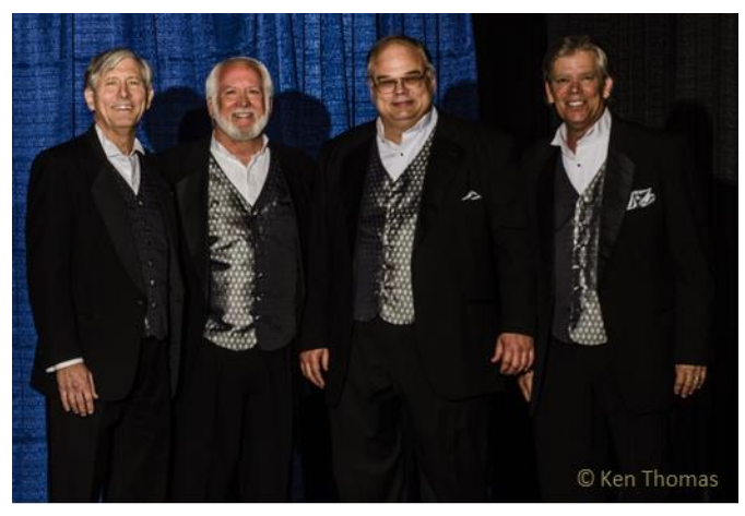
Hazardous Moving Parts Seniors Quartet Champion