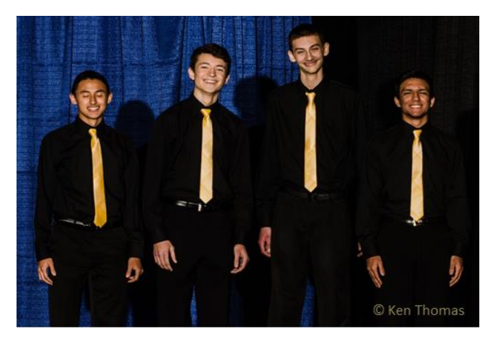
No Strings Attached Youth Quartet Champion, Novice Quartet Champion Int'l Youth Quartet Reps for 2016 Contest