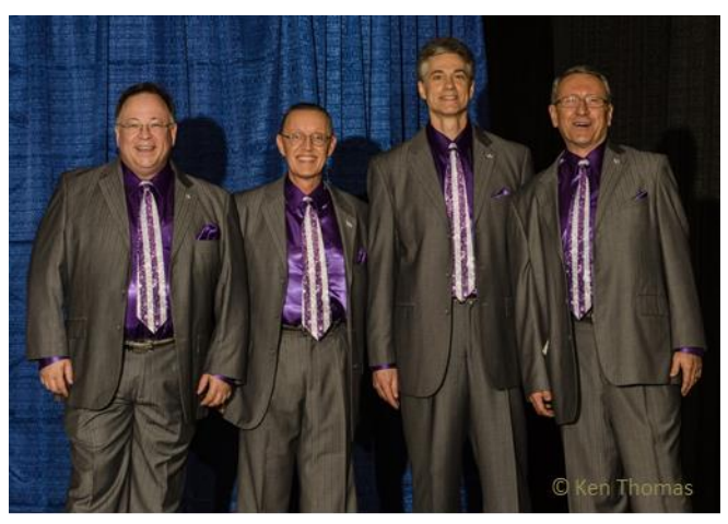
Let's Sing! Int'l Quartet Reps for 2016 Contest