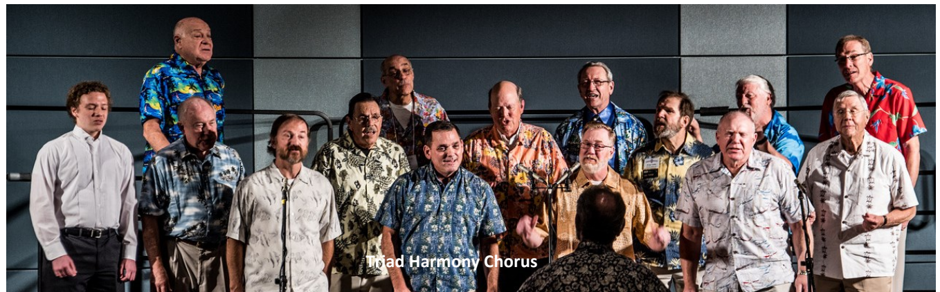
Tread Harmony Chorus