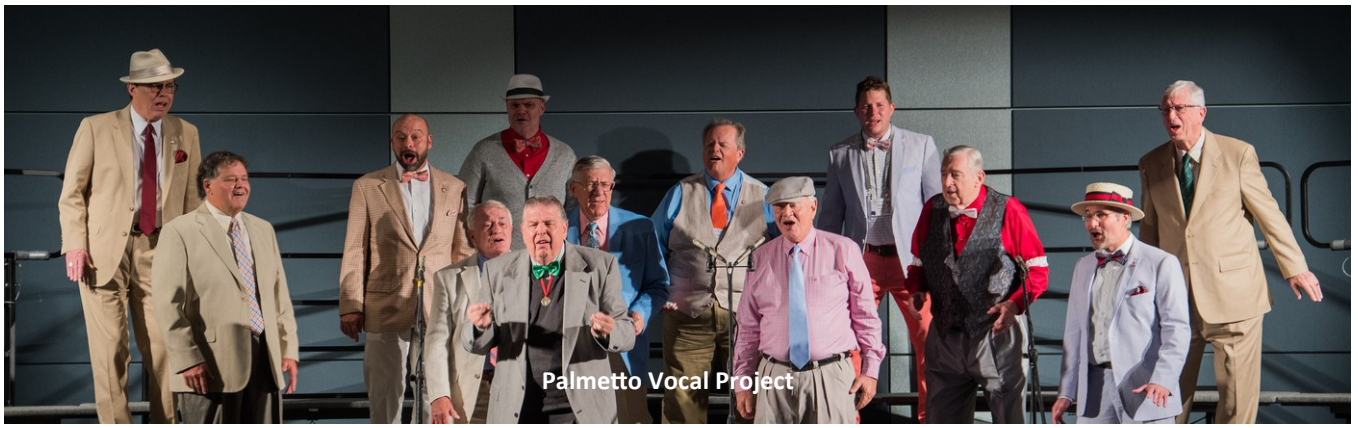
Palmetto Vocal Project