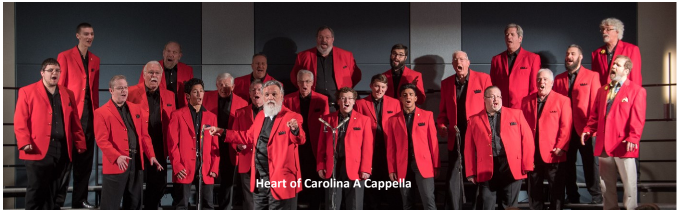
Heart of Carolina A Cappella