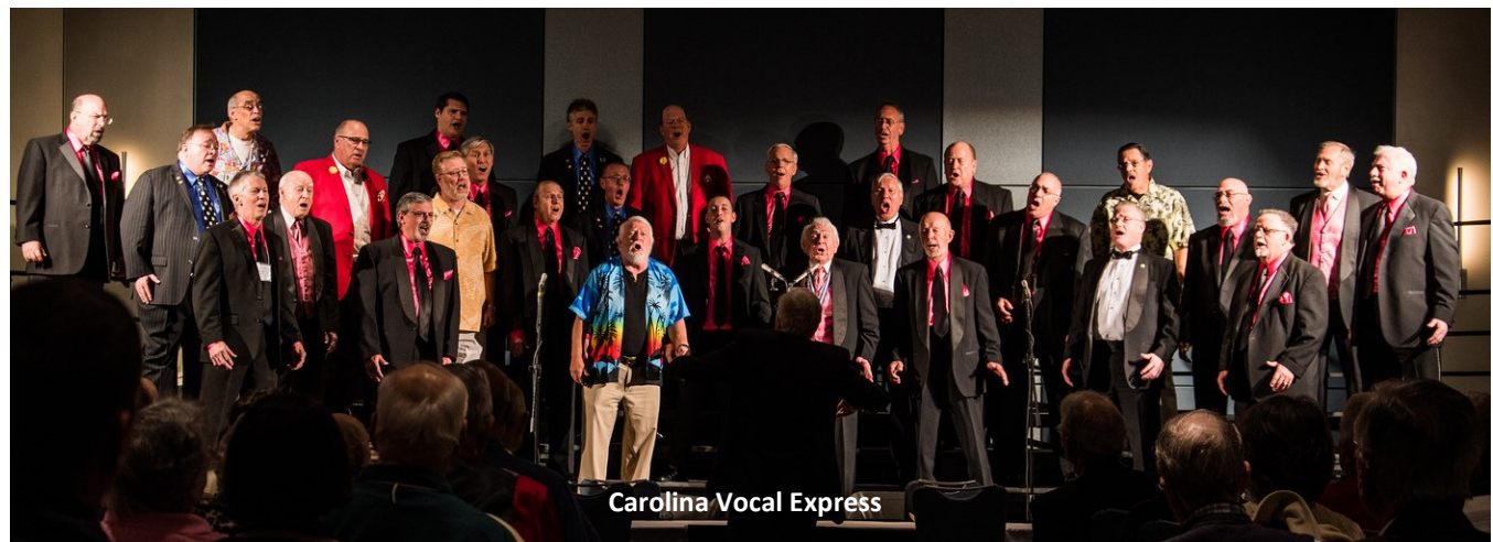
Carolina Vocal Express