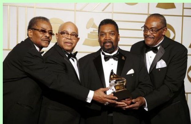
The Fairfield Four Wins Grammy for Best Roots Gospel Album

Handy, and Louis Armstrong have in common? All sang in barbershop quartets on New Orleans street corners as young men as they became the world's