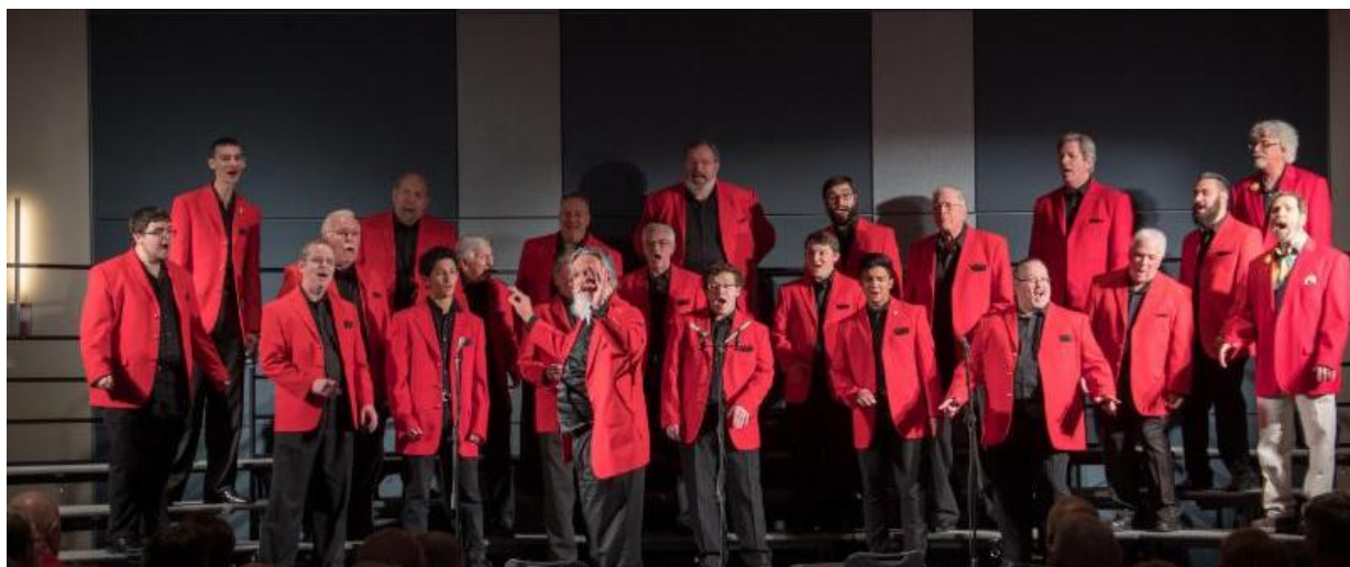
Heart of Carolina A Cappella