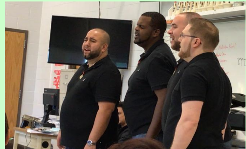
Signature at Martin Middle School Oct 2016