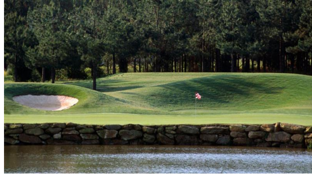
Heritage Golf Course

Start time is 1PM. Tickets are $100 and include greens fees, a bucket of balls, a golf cart for two, and a delicious awards dinner at the end of the day's play.