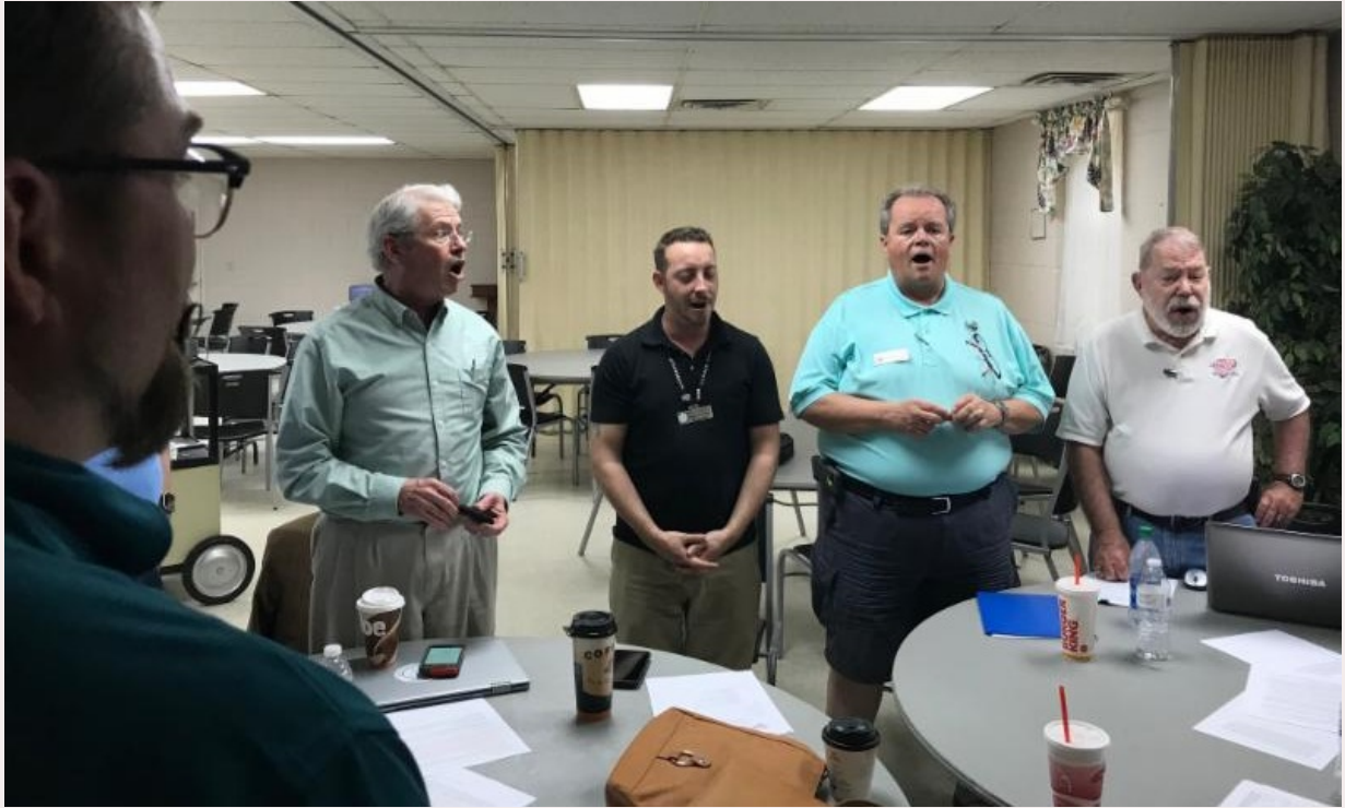
NSC Board Meeting: Singing goes a long way in reminding us we're on the same team.