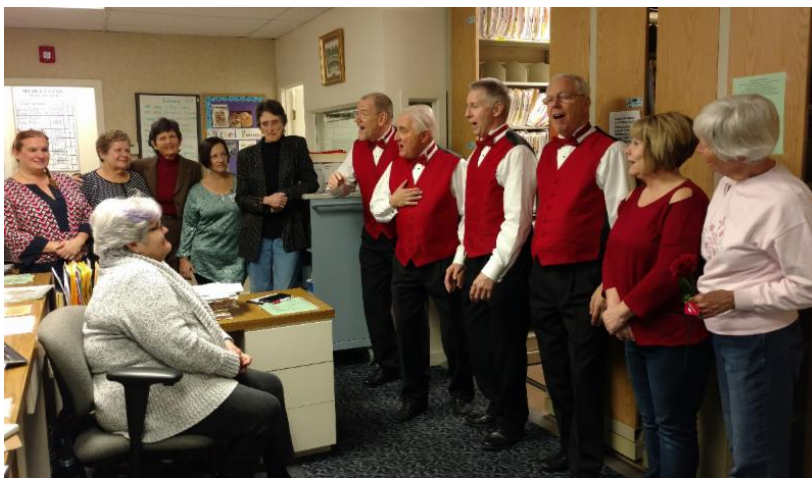
Cupid delivers to the Merci Clinic

Local folks received visits on Wednesday, February 14 and wives and sweethearts of our military saw cupid free of charge on Tuesday, February 13. Deliveries were made to residences, businesses, schools, hospitals, nursing homes, gyms and restaurants between the hours of 8 a.m. and 6 p.m. in the New Bern and Havelock areas.