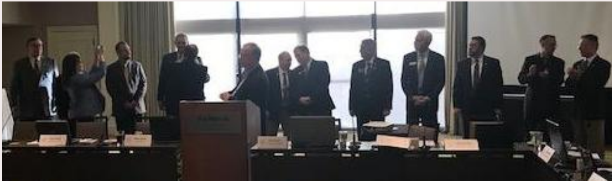
Installation of the 2018 Society Board of Directors

The Society Board of Directors invited the District Presidents Council to attend their open meeting on January 17 at the 2018 MidWinter Convention in Costa Mesa, CA.