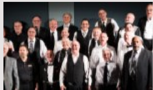
Carolina Statesmen at Fall Festival 2017

On Saturday, February 3rd, the Carolina Statesmen, our District Senior Chorus, gathered in Winston Salem for their first rehearsal of the spring season in preparation for their performance at the Spring Convention in Charlotte. The Statesmen will sing as a part of the chorus contest during the convention in March.