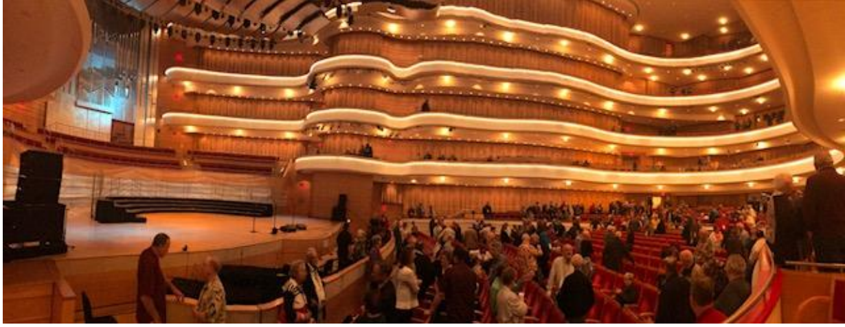
Segerstrom Center for the Arts

The curvy lines of the balconies gave you a feel of being on a cruise ship, but the shoe box shape was acoustically outstanding.