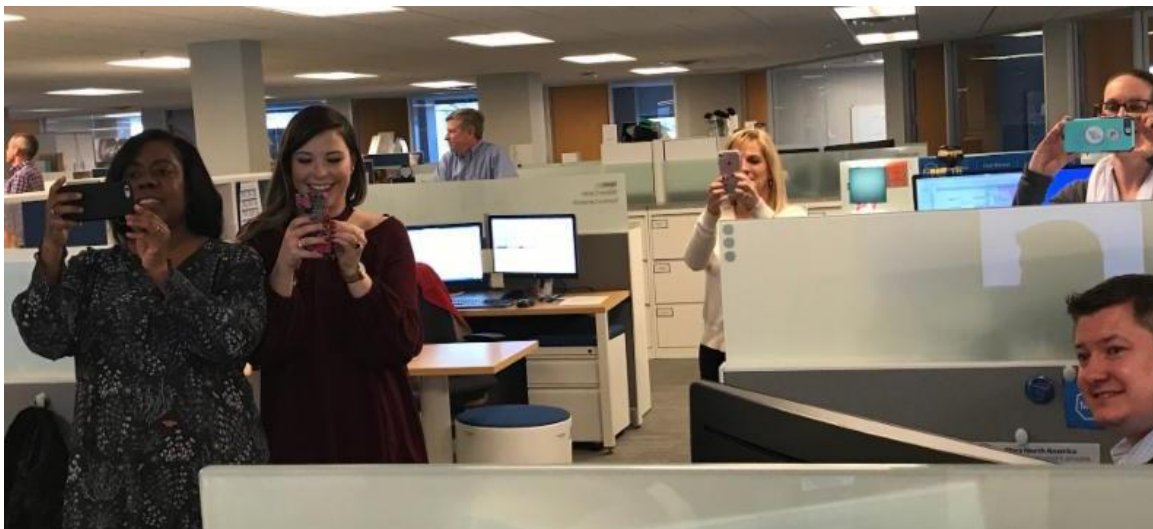
Employees at Merz Video the Fun

Of course, the prairie dog effect was rampant in the corporate cubicles at Merz as we delivered a Valentine to one of the managers.