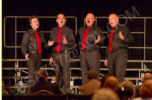
Lucky Four Us