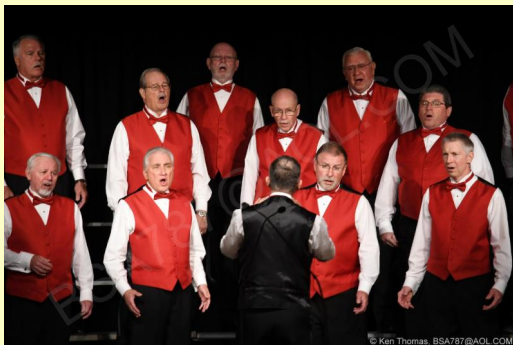
The Southern Gentlemen