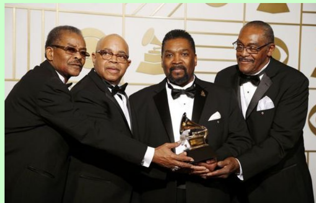
The Fairfield Four Wins Grammy for Best Roots Gospel Album