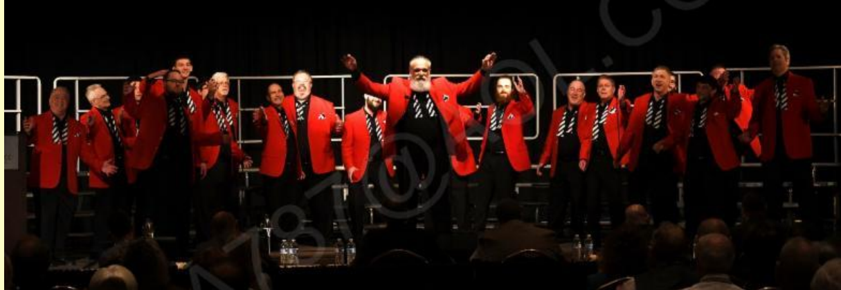
District Champions Heart of Carolina A Cappella