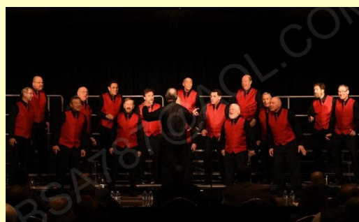
Triad Harmony Express

Rounding out the chorus competition was the Triad Harmony Express (4th), the Cross Creek Chordsmen (5th), the Tarheel Chorus (6th), the Palmetto Statesmen (7th), the Land of the Sky (8th) and The Southern Gentlemen (9th).