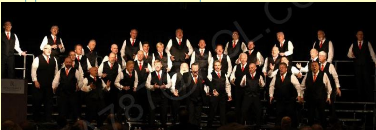
International Representatives Palmetto Vocal Project

And Getting Gold are Palmetto Vocal Project as International Reps and Heart of Carolina A Cappella as District Champs.