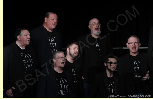
Cross Creek Chordsmen