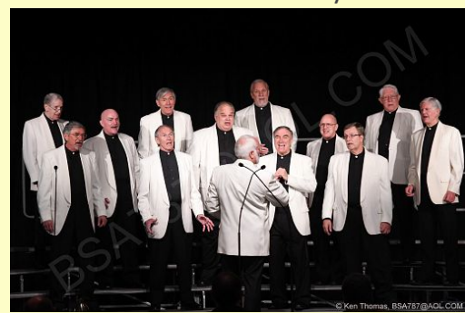
Cape Fear Chordsmen

The Cape Fear Chordsmen and the Carolina Statesmen competed for score only.