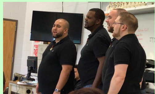
Signature at Martin Middle School Oct 2016