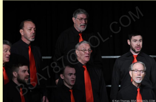
Land of the Sky