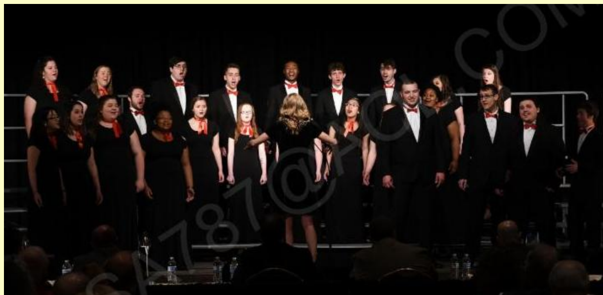
Catawba Valley Voices

Two of the choruses are students from Catawba Valley Community College - and what a great show they put on. The mixed chorus, Catawba Valley Voices, wowed the crowd.