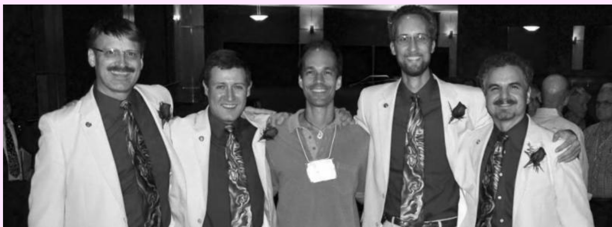
Better your quaret with the fifth man

TADAAA!!! How great that you've decided to improve your singing by bringing in a coach. Getting a "fifth ear" not only makes your ensemble better, but it's much more enjoyable for the audience members. So, add two layers of happiness, and get ready to Step in to the Sound!, create Unity of Purpose and Experience the Art and Joy of Music. I look forward to scheduling a session with you.