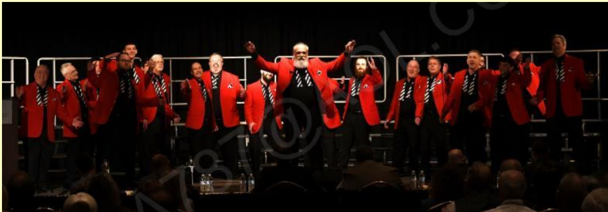
District Champions Heart of Carolina A Cappella