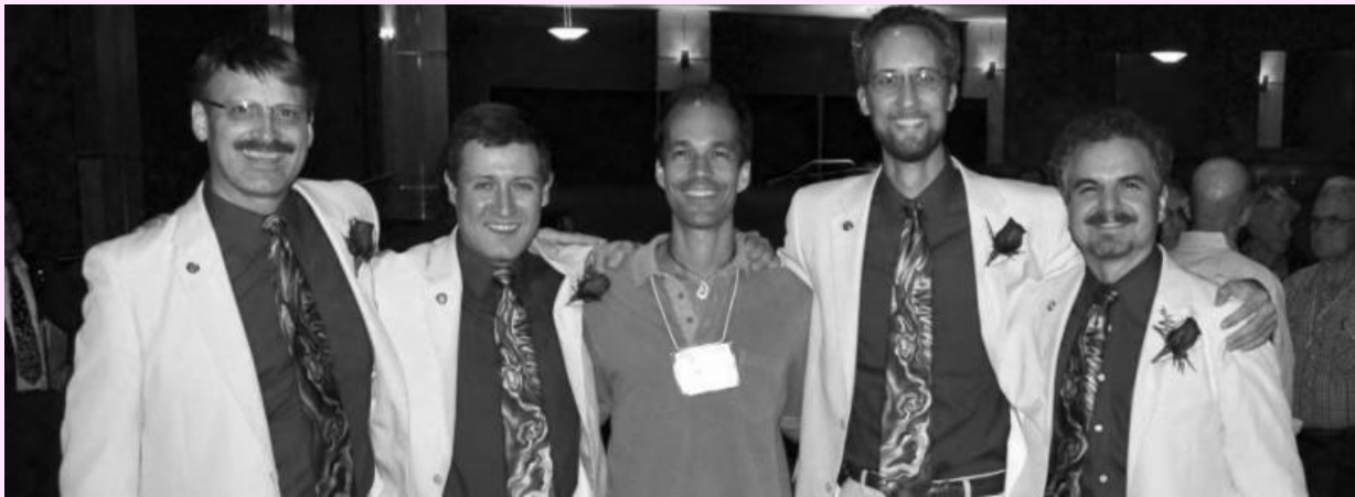
Better your quaret with the fifth man

TADAAA!!! How great that you've decided to improve your singing by bringing in a coach. Getting a "fifth ear" not only makes your ensemble better, but it's much more enjoyable for the audience members. So, add two layers of happiness, and get ready to Step in to the Sound!, create Unity of Purpose and Experience the Art and Joy of Music. I look forward to scheduling a session with you.