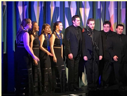
The Ladies and Prak Street Power