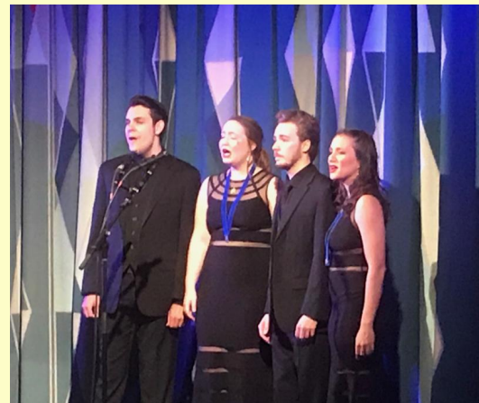
A Lady Power Mix

The second strategy was to hire as headliners and up-and-coming quartet--Pratt Street Power. This reduced talent cost from a 'gold-medal level quartet and had the added advantage of appealing to a younger audience. The inclusion of The Ladies in the mix resulting in virtually five performing groups for the cost of two as they performed separately, together, and in two combinations of mixed quartets.