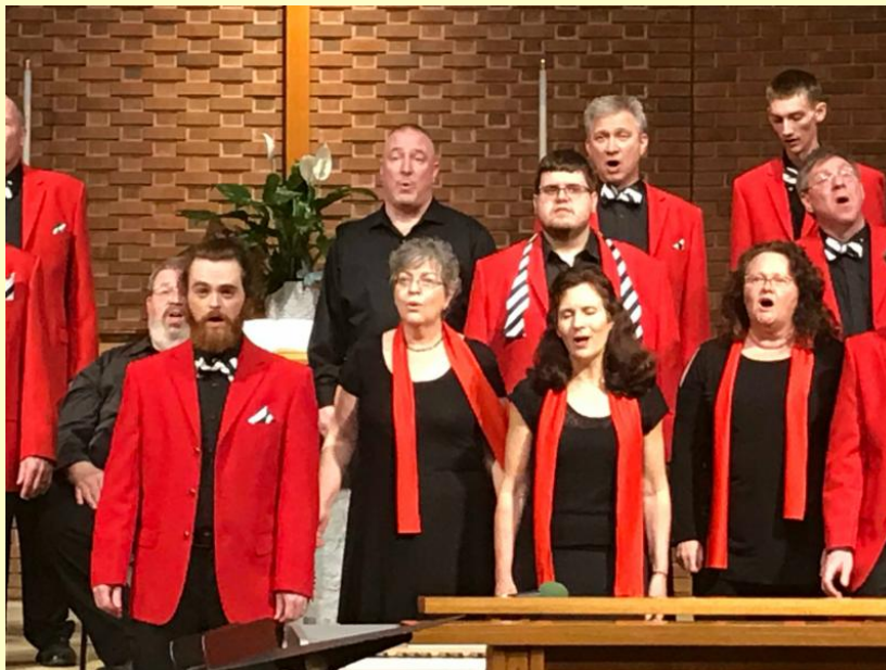
The mixed chorus creates exciting new palettes of sound and invites exploration of multi-part harmonies.

The mens chorus opened the show with their contest set and standard barbershop repertoire..