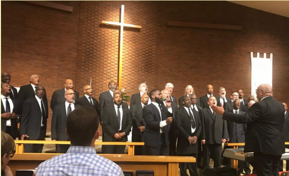
100 Men in Black

By all accounts, the concert was an a cappella tour de force and an artistic, as well as financial success. Over $1000 was raised after expenses to further the cause of the Barbershop Revival.