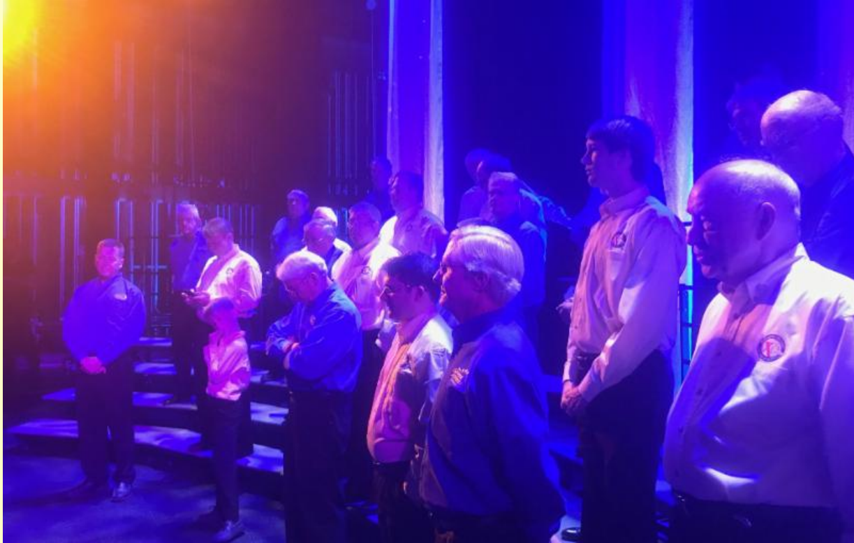
General Assembly and Carolina Harmony Brigade members await backstage

Even with all these things working for it, the RTP show just barely cleared a profit. The curse of operating in a thriving arts and entertainment area like the Triangle is that people have lots of choices on how to spend their evening (including enjoying their own flat screen TVs...)