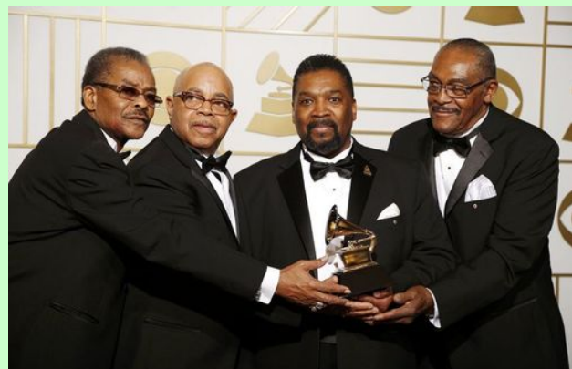
The Fairfield Four Wins Grammy for Best Roots Gospel Album