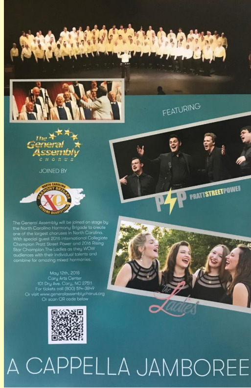
RTP's Show Poster