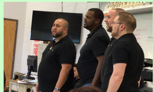
Signature at Martin Middle School Oct 2016