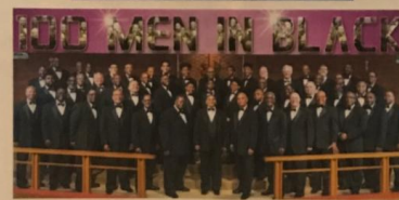
HCA Show Poster